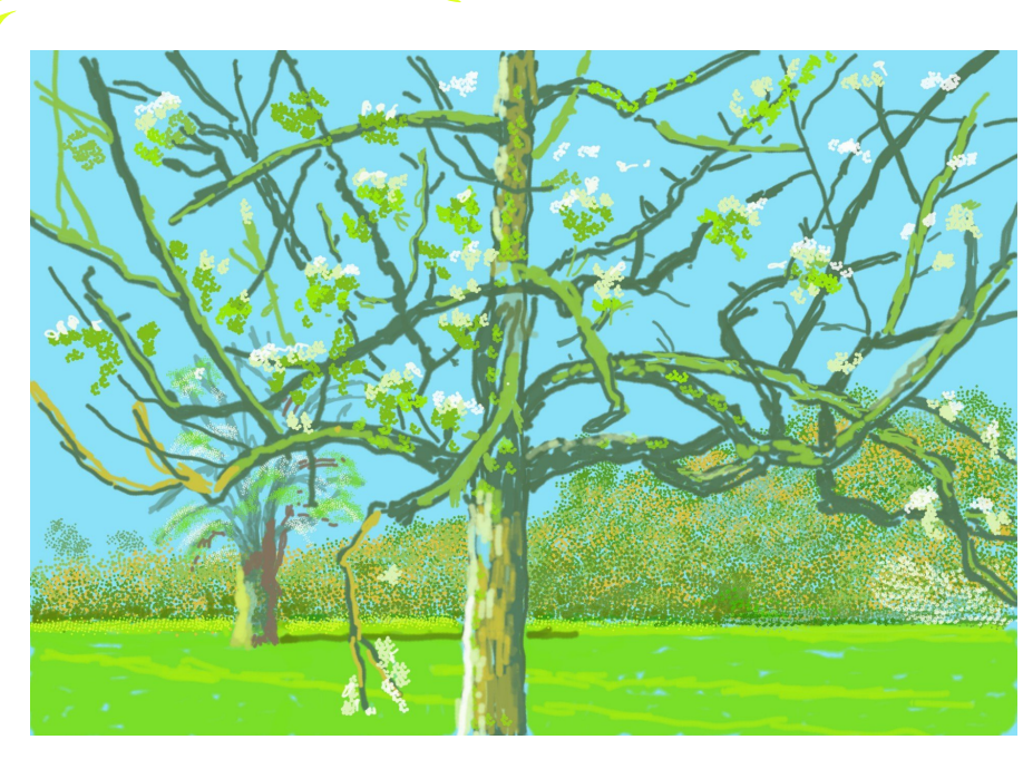
Exclusive iPad art from David Hockney - click the image to see more